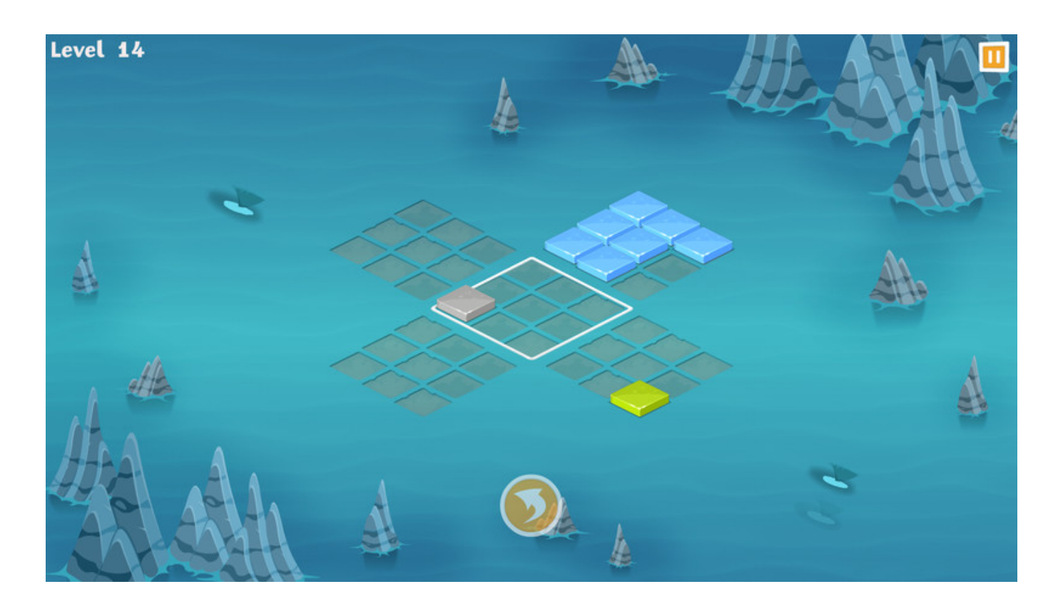
Perfect Fit - Totemland Key Serial

Download ->>->> <a href="http://bit.ly/2SHz4WS">http://bit.ly/2SHz4WS</a>